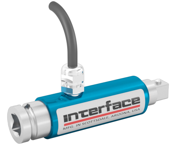
MODEL TS14 (Shown)