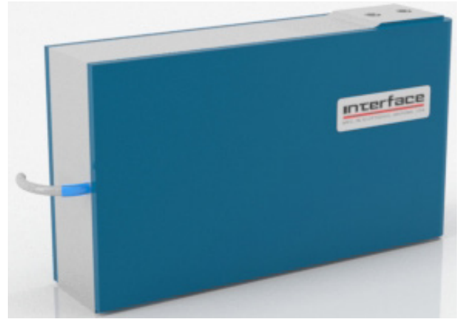
Model SPI (Shown)