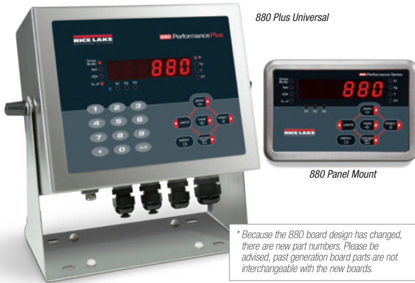
880 Plus Universal