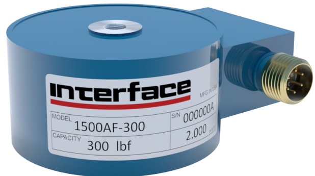
Model 1500AF-300 (shown)