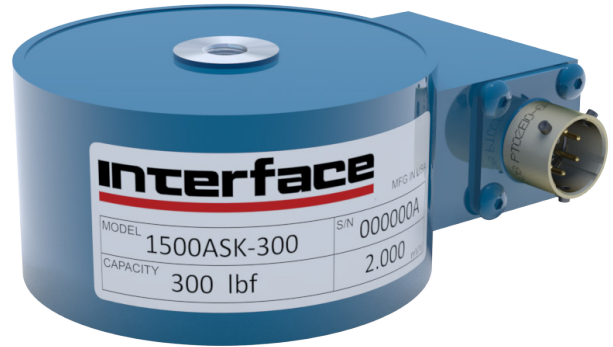
Model 1500ASK-300 (shown)