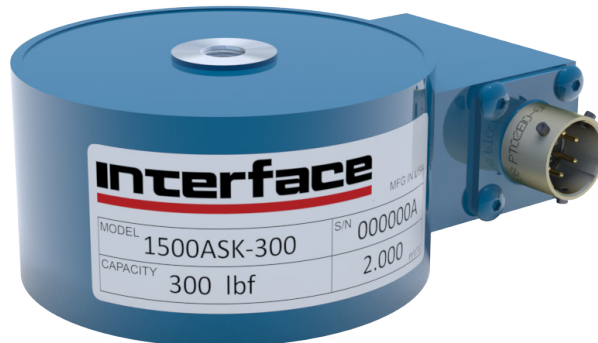
Model 1500ASK-300 (shown)