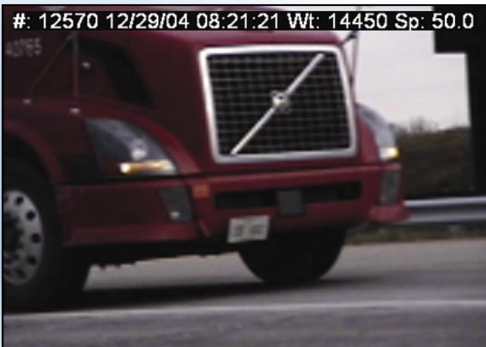
Video capture of selected vehicles.