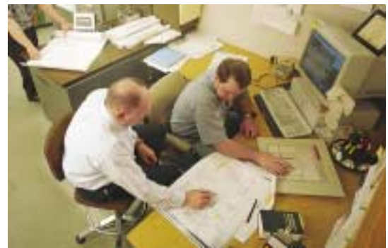
Our engineering team heavily scrutinized every load-bearing component of the ProLift.