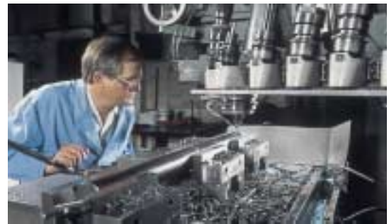
Computer-controlled milling with skilled operators ensure strict adherence to specifications.