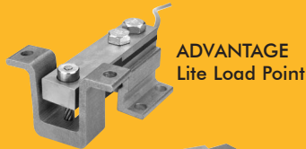
ADVANTAGE Lite Load Point

Hardy Instruments carries a wide variety of strain gauge load points and scale bases to accommodate your applications requirements.