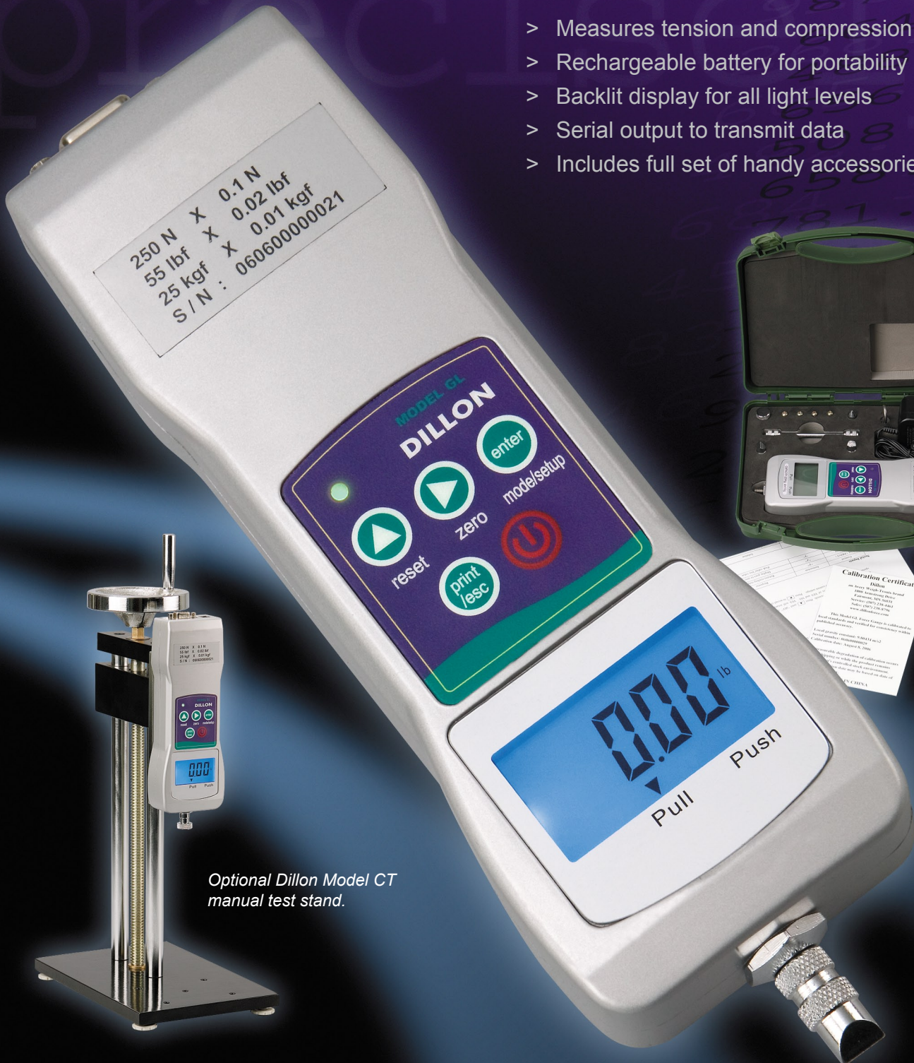
Optional Dillon Model CT manual test stand.