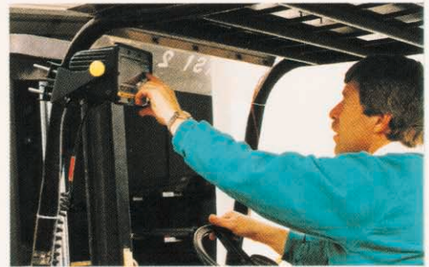
▲ A lift truck is just one of hundreds of applications for MSI digital weight indicators. They can improve any electronic load cell application.

SETPOINTS: Customize parameters, including display messages, for up to eight setpoints. You can compose detailed alphanumeric messages that incorporate data such as time, date and weight. Batching is easy because the setpoints ensure accurate timing, while your messages indicate the quantity and name of the next ingredient. Or you can define a series of weight ranges (grading zones) and display the appro-